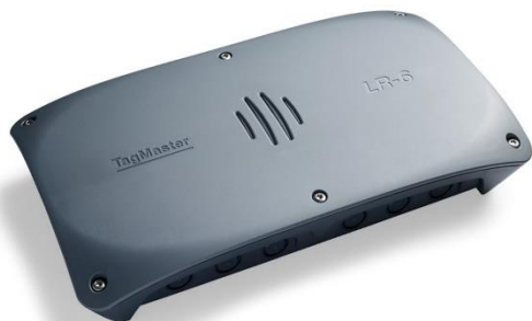
Part No. 154600