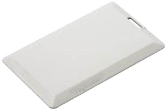
Part No. S1255