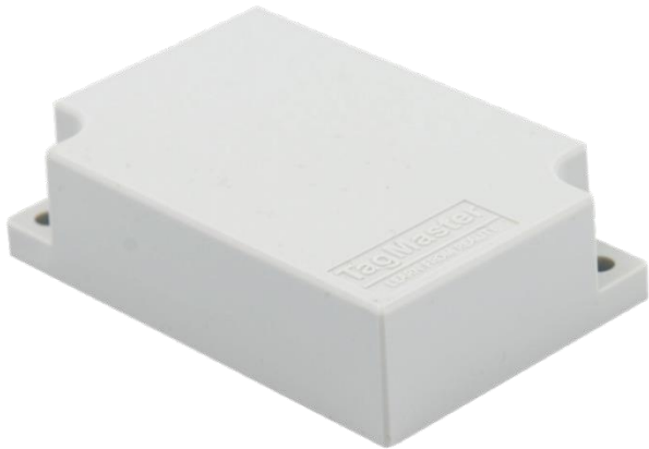
Part No. S1355

Each tag has a unique pre-programmed identity code to maximize the security of the transmission and prevent tag duplication.