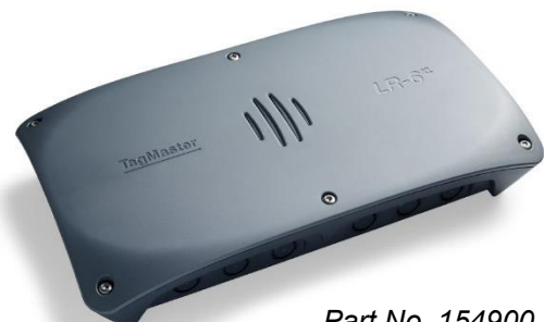
Part No. 154900

Dimensions/ Weight: 11.4 x 5.2 x 2.2 in / 2.2 lbs.