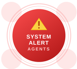
Real-Time Monitoring & Notifications

Operational intelligence with real-time, near-real-time metrics, post event analytics, dashboards, and performance insights.