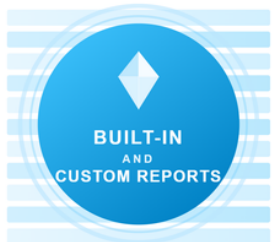
Clear Insights • Data Clarity

Automated notifications for compliance, overstay, hotlists, dispatching, and operational anomalies.