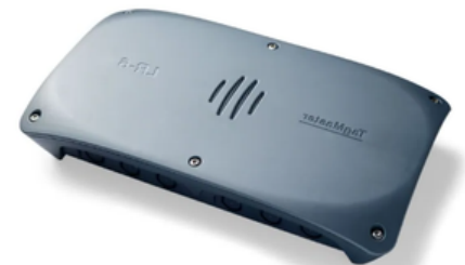
Long Range RFID: LR-Series