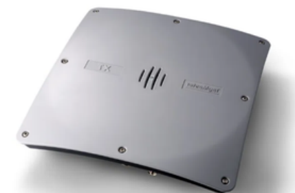
Long Range RFID: XT-Series

*CogniTrack is powered by ©ArmID, Inc. and used under license. Any unauthorized use, copy, reproduction, or distribution of this software is strictly prohibited*