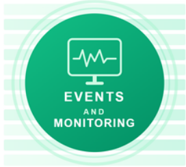
Real-Time Event Visibility

Real-time tracking of vehicle activity, curbside flow, and transportation operations.